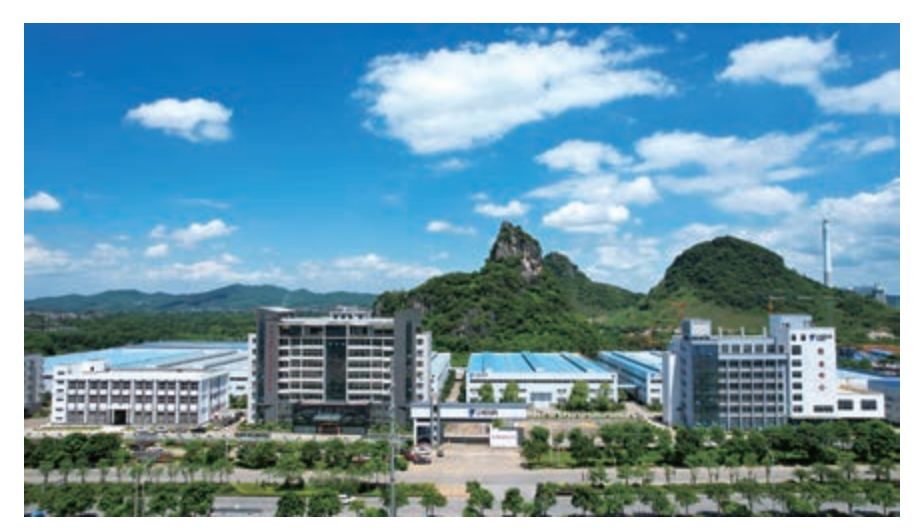
Rooftop distributed photovoltaic (DPV) project

Over the years, the Group has been grasping different opportunities to expand our business, accelerate the transformation and make the Group a more environmentally friendly, and safer place for employees and users (such as automation, and utilizing digital platforms for online conferences to reduce carbon footprint in transportation during the COVID-19 pandemic). These measures have made the production facilities and offices of the Group becoming more sustainable and thereby fulfilling the commitment to resource management and environmental protection.