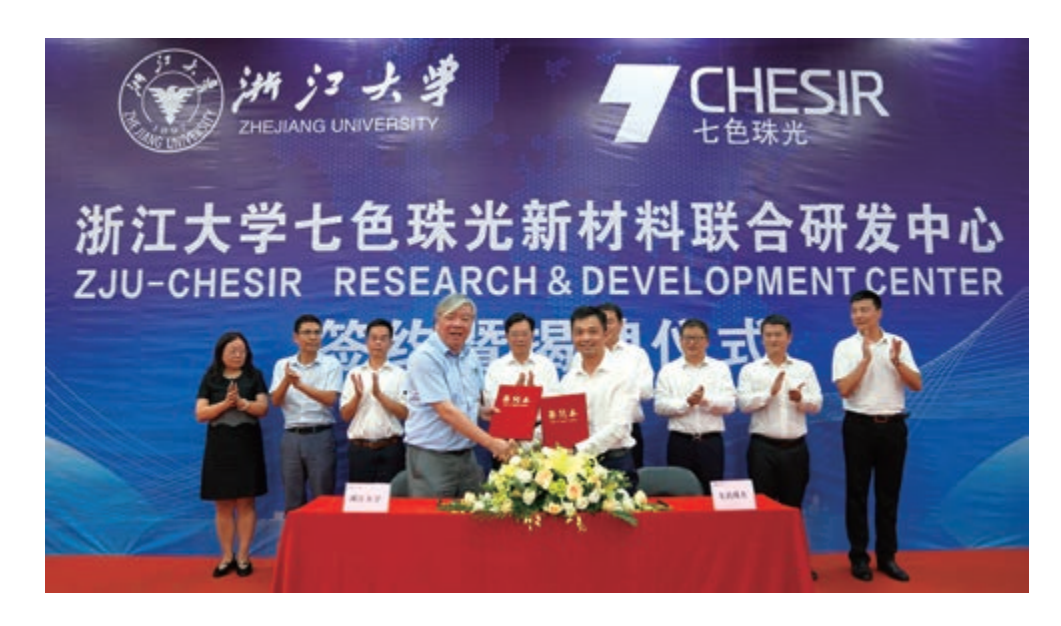
Signing and Unveiling Ceremony of Zhejiang University -Chesir Pearlescent New Materials Joint Research and Development Centre

The Group is dedicated to explore the nature of colour by technological innovative means. Through continuous exploration and research and development, the Group has developed the pearlescent pigment products based on four main basic materials, including natural mica, synthetic mica, glass flakes, and silicon dioxide.