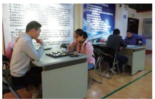
Chinese chess competition